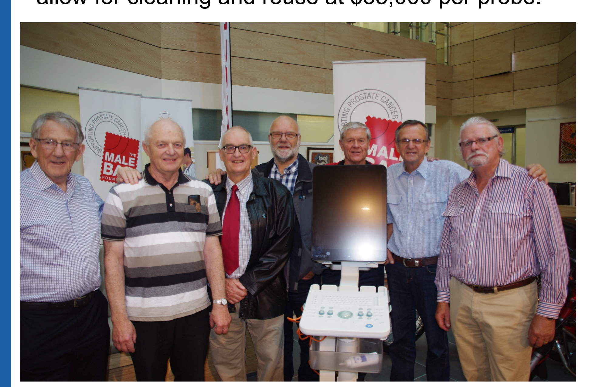
Members of the Male Bag Foundation & Ballarat Prostate Cancer Support Group with the Transperineal machine

The transition of the service was made easier by the knowledge of the Urology registrar who had been performing these biopsies at his previous place of employment. Competition for theatre time can present a few issues at times and with the increase in demand it has been necessary to purchase 3 probes in total to allow for cleaning and reuse at $35,000 per probe.